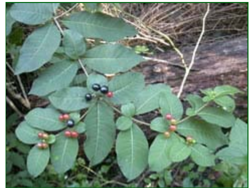
Rauvolfia tetraphylla (be still tree, four-leaf devil-pepper)