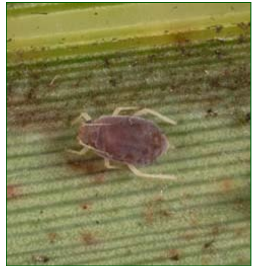
Melanaphis sorini