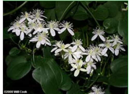
Clematis terniflora DC (sweet autumn virginsbower, Japanese clematis)