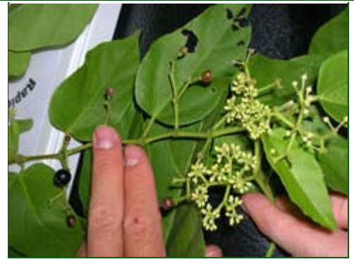
Cissus verticillata (possum grape, princess vine) flowers and fruit