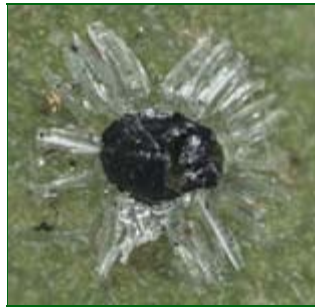
Aleuroplatus cococolus

Aleuroplatus cococolus , a Continental USA record. Two samples of this whitefly were