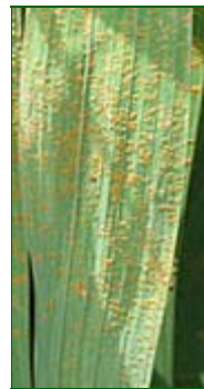
Uromyces transversalis

Uromyces transversalis ( gladiolus rust ) was reported in Florida for the first time this year. The first detection of Uromyces transversalis in the United States was made on Gladiolus x hortulanus (garden gladiolus) in Manatee County, Florida, in April 2006.