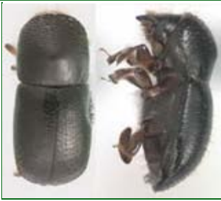
Euwallacea interjectus

collected from Coccoloba diversifolia in a parking-lot in Miami-Dade County. This species probably is native to the Caribbean or Central America, where it is known from a wide diversity of plant species, some of which are economically important fruit species, although this whitefly does not appear to be an economic pest.