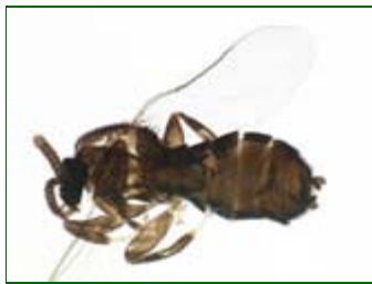
Holoplagia guamensis

has subsequently been identified from two nurseries. The second, in Apopka, was on fern material ( Polystichum sp.) acquired from the Jacksonville nursery where the Continental record was discovered. In the Jacksonville nursery, it was present in high numbers with all life stages present.