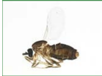
Neorhegmoclemina bisaccata

This species, a minute black scavenger fly, is not a plant pest. This species has been reported previously from New York.