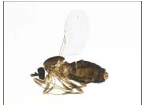
Neorhegmoclemina bisaccata