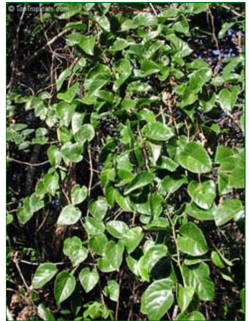
Cissus verticillata (possum grape, princess vine) foliage