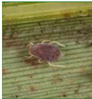
Melanaphis sorini

Tessaropa tenuipes , a State record. This species is a longhorned wood-boring beetle (Cerambycidae). It is native to the central and eastern United States, but heretofore has never been collected in Florida. It is found in small dead branches of hardwoods (hickory, oak, walnut, beech) and is uncommon.