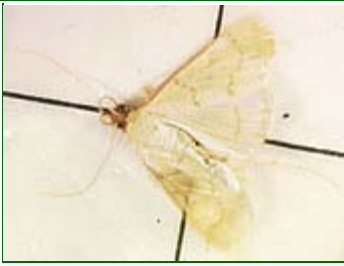
Hahncappisia neomarculenta

and St. Lucie counties. The larval hosts are not known, and it is not expected to be of economic importance.