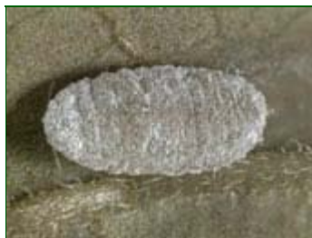
Phenacoccus multicerarii

Phenacoccus multicerarii , a Continental USA record. This mealybug species