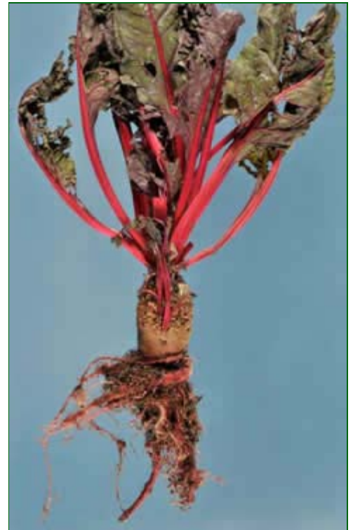
Beta vulgaris (Swiss chard) infected with Meloidogyne incognita . Whole plant showing root galling induced by this nematode.